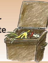
Biowaste Container for Organic Waste