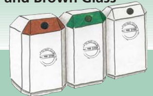
Glass – Separated into White, Green and Brown Glass